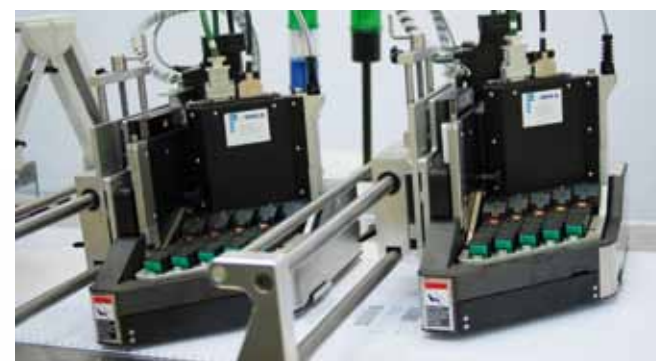
Installation of 2 IPAS425i modules on UNIGRAPHICA TransJet

Its modular design provides you with a flexible, cost-effective imprinting platform that is already UNIGRAPHICA tested and validated. The IPAS425i inkjet print module can print at speeds up to 182 Meter/Minute (approx. 600 feet per minute) and at print resolutions up to 1200 dpi with a 108 mm (approx. 4.25-inch) print width. Economical, high-capacity 775 ml bulk ink cartridges minimize operator intervention and can be replaced without interrupting a production run. Ink cartridges, printheads, and printhead cleaners are easily accessible, so replacement is quick and clean.