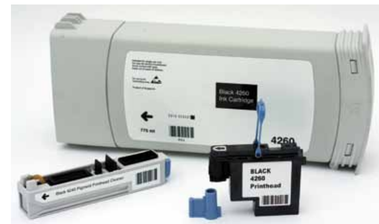
Consumables; Ink cartridge, Print head, Print head cleaner cartridge